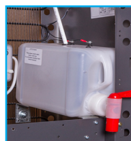
Overflow Kits; 10 Ltr Overflow Kit to extend the Drip Tray capacity (factory installed) We also supply a 3 Ltr Overflow Kit for self install