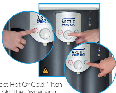
Select Hot Or Cold, Then Hold The Dispensing Button Down

In a hard water area you have the option to connect a Scale Removal Filter to the Boiler inlet and a Carbon Filter to the Chiller Inlet. This significantly extends the life of the more expensive Scale Removal Filter