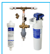
Installation Rail for hard water areas. This includes a carbon block candle for the chilled water inlet & a scale removal filter for the hot water inlet