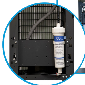
In a soft water area you only need a Carbon Filter to connect to the Boiler and the Chiller inlet