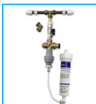
Cooler/Boiler Installation Rail for Soft Water area with a Carbon Filter. Includes compression fitting. Water block. Copper pressure reducing valve and non-return valve