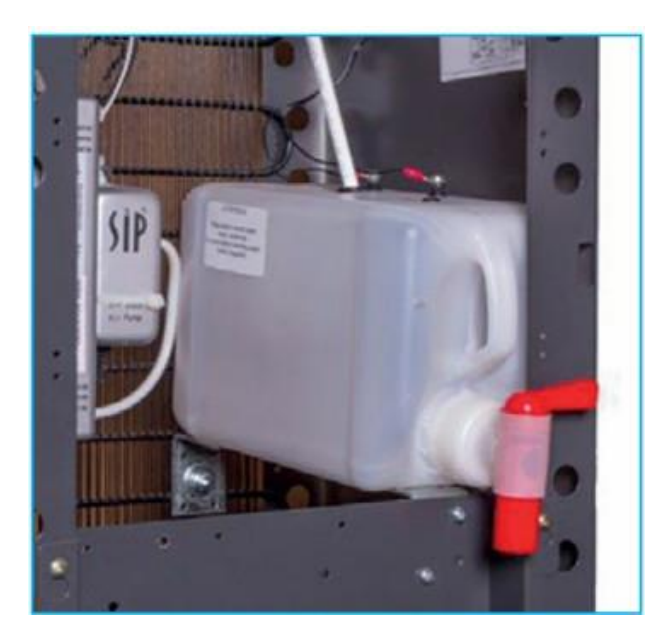
The drip tray has been designed to allo w for a 3 or 10 litre overflow kit to be fitted.