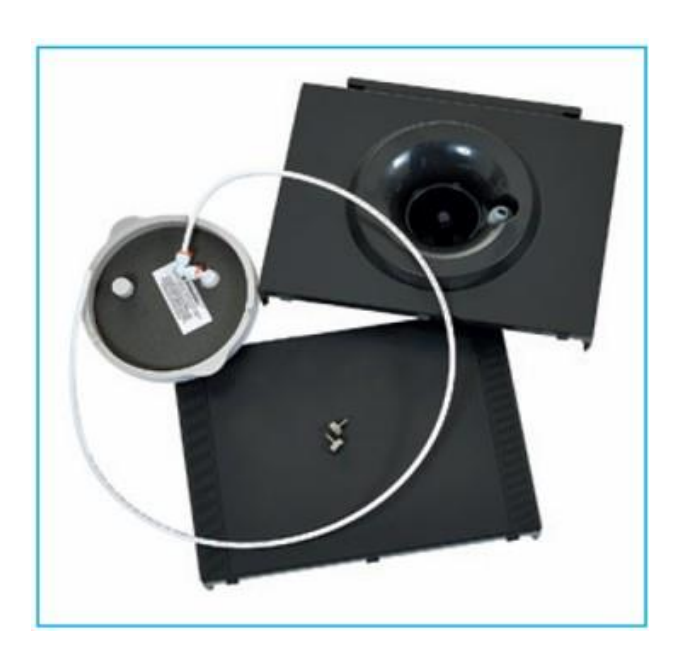
Easily convertible from bottled to POU. The bottle top includes Sp illG u ard leak protection.

Perhaps the most reliable Water Cooler on the market! 85,000 Coolers sold tell their own story.